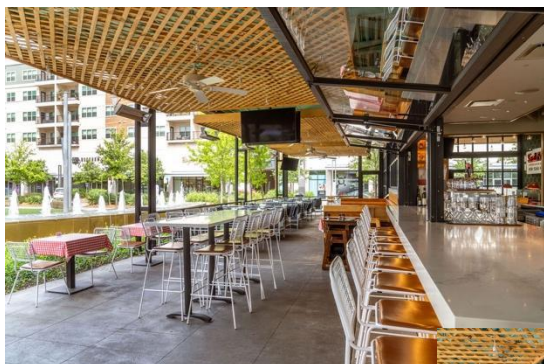
COVERED PATIO (wind screens and radiant heaters allow for cool weather use)